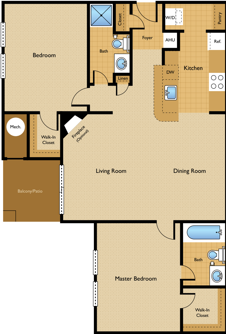
All dimensions are approximate.